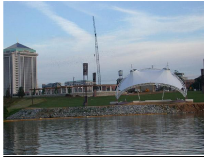
Riverwalk Pavilion on Alabama River

The City of Montgomery is in the midst of downtown and riverfront revitalization. Part of the plan is the development of a Riverfront District, on the Alabama River. The district will consist of shops, restaurants, arts and entertainment and loft apartments, all within walking distance of a new convention center and hotel. The purpose of the extensive project is to draw residential and visitor traffic to downtown Montgomery by emphasizing compact, pedestrian and bicycle friendly urban design.